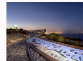
Viewpoint from the lighthouse