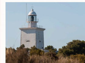
Lighthouse of Santa Pola

Its location allows you to contemplate spectacular views of the bay of Santa Pola, Alicante and the Island of Tabarca.