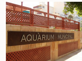
The Aquarium of Santa Pola

It is an important educational and recreational tool which introduces the maritime surroundings of the bay of Santa Pola and the Island of Tabarca. The water comes directly from the sea.