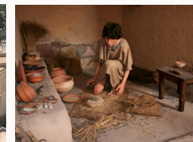
The Maritime Museum