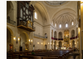
Inside the Co-Cathedral of St. Nicholas of Bari

The chapel of the Communion stands out, considered one of the most beautiful samples of the high Spanish baroque.