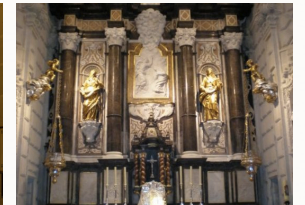
Chapel of the Communion