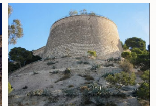
San Fernando Castle