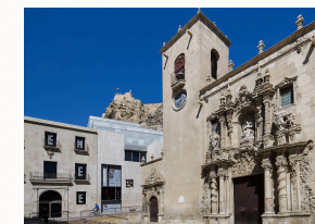
Santa Maria Church

Santa Maria Church is the oldest religious building in the city of Alicante, and dates back to the 14th century. It was built on the remains of the Main Islamic mosque in Alicante. After a fire suffered during the 15th century, the Church had to be rebuilt, because of this its facade is baroque and it is crowned by two asymmetric towers built in the 14th and 18th centuries.