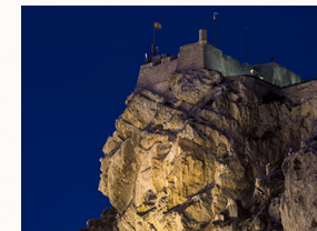
Santa Barbara Castle

Santa Barbara Castle, located at the top of Mount Benacantil and opposite El Postiguet beach and Alicante's sports marina, stands out for its grandeur and fantastic views of the city and the coast. It is undoubtedly the most emblematic location in Alicante and the most visited monument in the city.