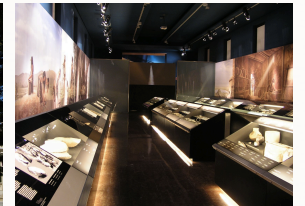
Permanent exhibition hall